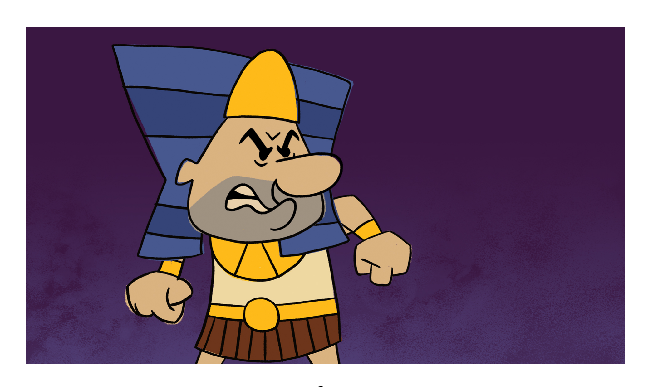
Moses Grows Up